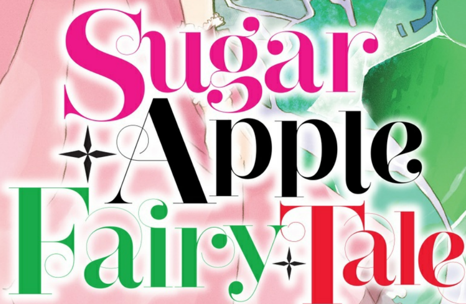
Illustration by Aki